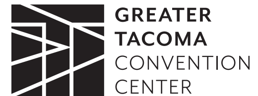
One-Color (black logo on white background)