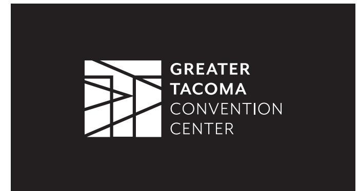
One-Color (white logo on black background)