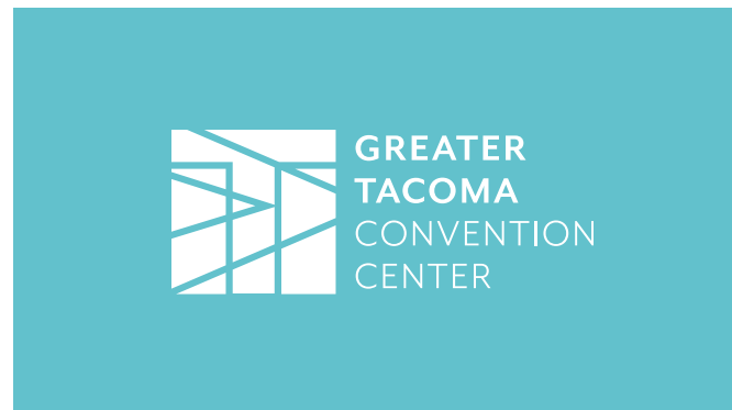
One-Color (white logo on color background)