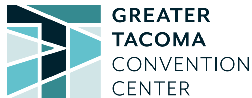
PRIMARY (full-color logo on white background)

The logo combines a “T” for Tacoma with a greater-than (>) symbol, which speaks to our broader region. Shades of sea-glass blue and green, the logo celebrates the glass art for which Tacoma is famous. It also gestures toward the growth and momentum we’re experiencing in Tacoma and the greater region.